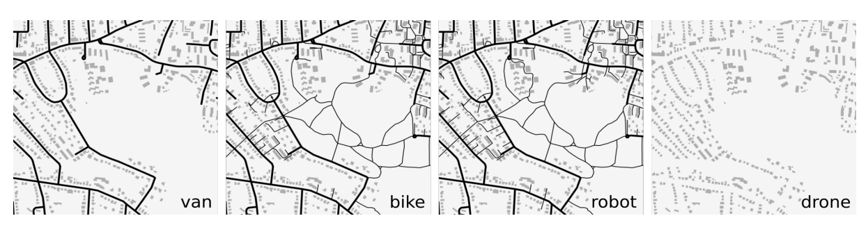
Fig. 3: Infrastructure being available for different types of vehicles in map segment S5.

the van. As the first-echelon van has comparably high capacity for the instances under investigation, there is enough space to carry all autonomous vehicles, even if they take up slightly more room than the parcels themselves. Since the test instances are based on real world map segments, the underlying routing data takes into account real distances and travel times according to the individual traffic infrastructure that each vehicle can use. This information has been derived from OpenStreetMap [58] using the corresponding routing profiles for vans and bikes. For robots, the pedestrian profile is assumed to be suitable because the speed used there is just slightly below the maximum of the manufacturers' specifications for this vehicle type [26]. For the drones, geodetic distances have been calculated and an average speed of 43 km/h is assumed [56]. Figure 3 illustrates the infrastructure networks being available for the different types of vehicles at the example of segment S5.