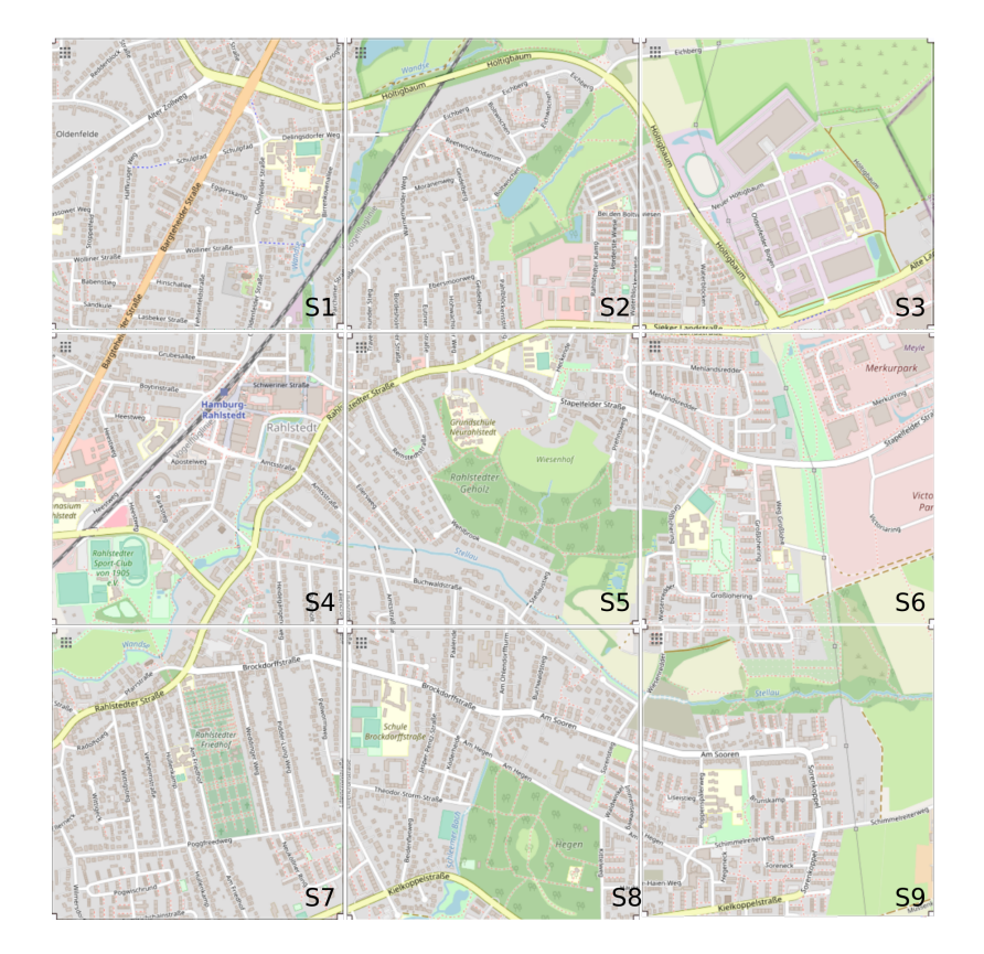
Fig. 2: Considered map segments of city of Hamburg.

In order to get a realistic comparison of different distribution systems, we consider nine adjacent map segments of the city of Hamburg, each of a size of 1x1km. The segments are referred to as S1 to S9 and shown in Figure 2. To build the instances, we derive for each segment the location of residential buildings via OSMnx 1.2.0 [50]. Assuming that each residential