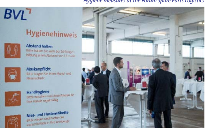
Hygiene measures at the Forum Spare Parts Logistics