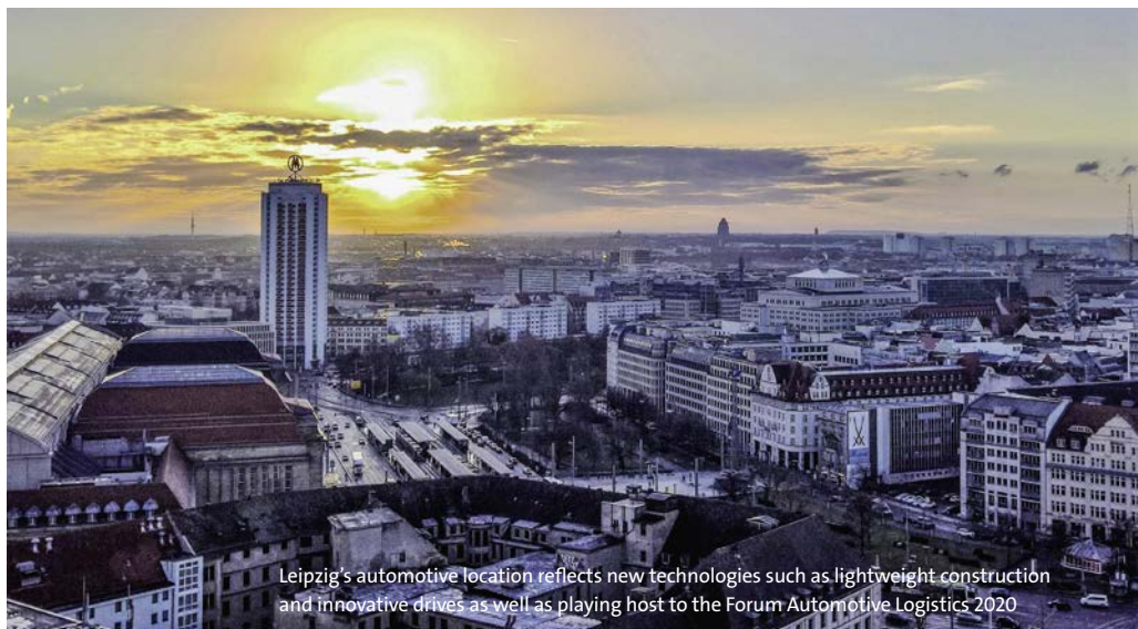
Leipzig's automotive location reflects new technologies such as lightweight construction and innovative drives as well as playing host to the Forum Automotive Logistics 2020

TRADITION The regional state of Saxony can look back on a long history as an automotive location. Innovations in the mobility sector like the left-hand steering wheel, central gearstick, series-produced front-wheel drive – many things that we take for granted today – have been devised in Saxony for more than 100 years. The Trabant was the first car with a plastic body as standard. Even after reunification, Saxony continued to hold its own as a centre of automotive excellence, with many famous carmakers opening factories there. In a nutshell, Saxony is a competence hub for all things automotive. The regional economic enterprise agency estimates that today roughly one in eight cars built in Germany comes from Saxony, which is home to a total of five vehicle and engine production plants as well as 780 component suppliers, equipment manufacturers