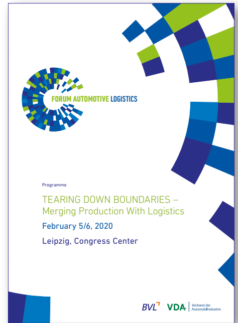
The Forum Automotive Logistics conference programme along with the evening event will be simultaneously translated into English.

All this means that the Forum Automotive Logistics 2020 will be taking place against an exciting backdrop. The presentations will be held in the Congress Center Leipzig, and – like the evening event at Porsche, during which the VDA Logistics Award will be presented – will all be simultaneously interpreted into English. The session entitled “Supply Chain Organisation” on February 5 from 2.15 to 3.45 pm and the