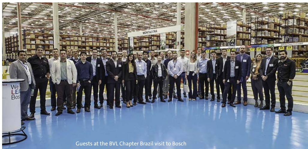
Guests at the BVL Chapter Brazil visit to Bosch