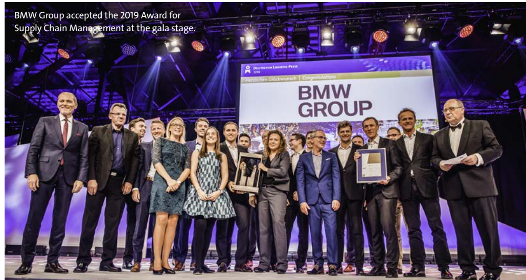
BMW Group accepted the 2019 Award for Supply Chain Management at the gala stage.