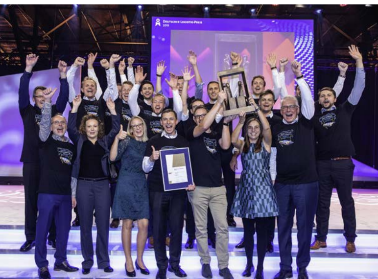
Celebrating themselves and celebrated by attendees – the winners of the German Award for SCM from BMW

“Inspire – Encourage – Act”: the theme was also brought to life internationally.