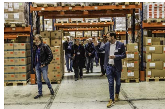
Asensus was one of the companies to open its doors to the public on Supply Chain Day

Over 300 companies from 15 different countries opened their doors to roughly 23,000 visitors in total on 2019's Supply Chain Day which took place on 11th April. BVL's annual day of action initiative offers students and the general public, who may normally not consider career opportunities in logistics and supply chain, "behind-the-scenes" insights to the diversity and complexity of logistics. Companies including Amazon and 2018 winner for the German Logistics Award, Komsa Kommunikation Sachsen AG played host on the day of action. BVL Chairpersons from China – Beijing, China – Hefei, Korea – Seoul, and Chapter Turkey, also organised Supply Chain Day events on the day.