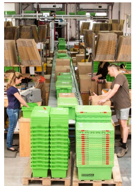
The green memo boxes are the centrepiece of the shipping system.