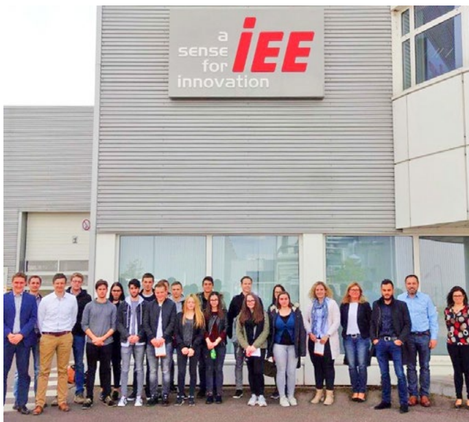
Participants at the IEE event