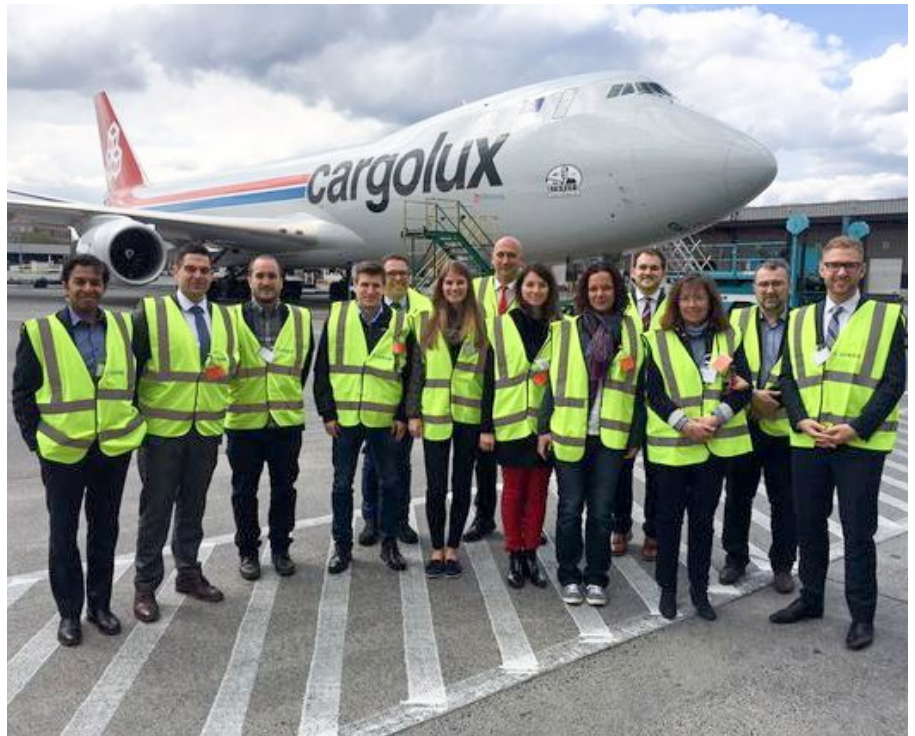
Participants at the IEE event

➔ Luxembourg 12 participants gathered together at LuxairCARGO Cargo Centre to visit Luxembourg's ground handling operator. The company currently employs more than 1,100 employees and handles over 1.2 million tons of freight per year with expansion possibility. After a welcoming and short networking session, the participants learned in a presentation about the largest airfreight handler at the Luxembourg airport. In addition to a state-of-the-art-warehouse, the Cargo Centre also includes a logistics centre and a Goods Distribution Practice (GDP) health centre. On the ramp area, up to eight freight aircraft of category F can be accommodated at the same time, an average loading and unloading takes only 2 hours. Next to the theoretical part the partakers went to the actual visit of the cargo centre passing the security control and kicking the 1.5-hour supervised tour off. The diversity of cargo to be handled was particularly noticeable. In addition to temperature-controlled areas for pharmaceutical and health care products, dangerous substances, animals, perishable goods, high-tech products, but also consumption products are placed in the import and export