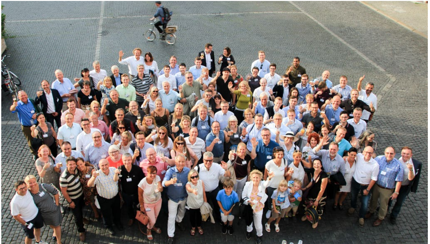
Chapter Chairs, Student Chapter Chairs, Young Professionals and friends of BVL came together in Thuringia.

➡ Chapter Management Meeting Where are we now, where do we want to be? Possible answers to questions like this were discussed by around 80 Chapter Chairs, Student Chapter Chairs and Young Professionals at the annual Chapter Management Meeting on June 15 and 16. The meeting was hosted by the Thuringia Chapter, who kicked off the event by organising a tour of Weimar complete with a quiz. The Chapter Chairs got down to work on day two in Erfurt and produced some excellent answers, many of which were closely connected to the new opportunities offered by digitisation. Four working groups focused on four specific topic areas – “Young BVL”, “BVL Today”, “BVL Tomorrow” and “BVL International”.