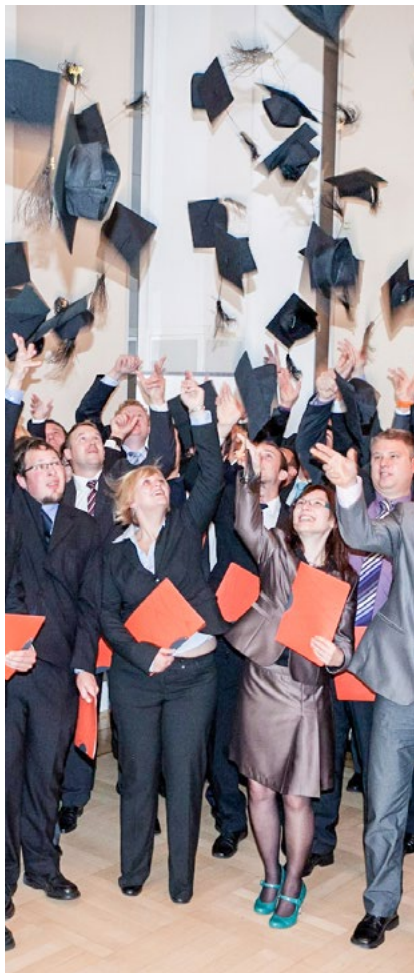
Students at DAV now have the chance to gain a double degree.