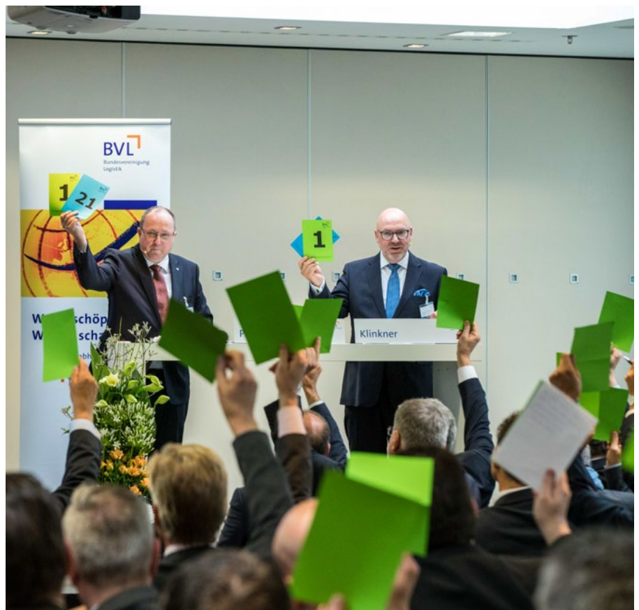
Voting at the 39th General Assembly