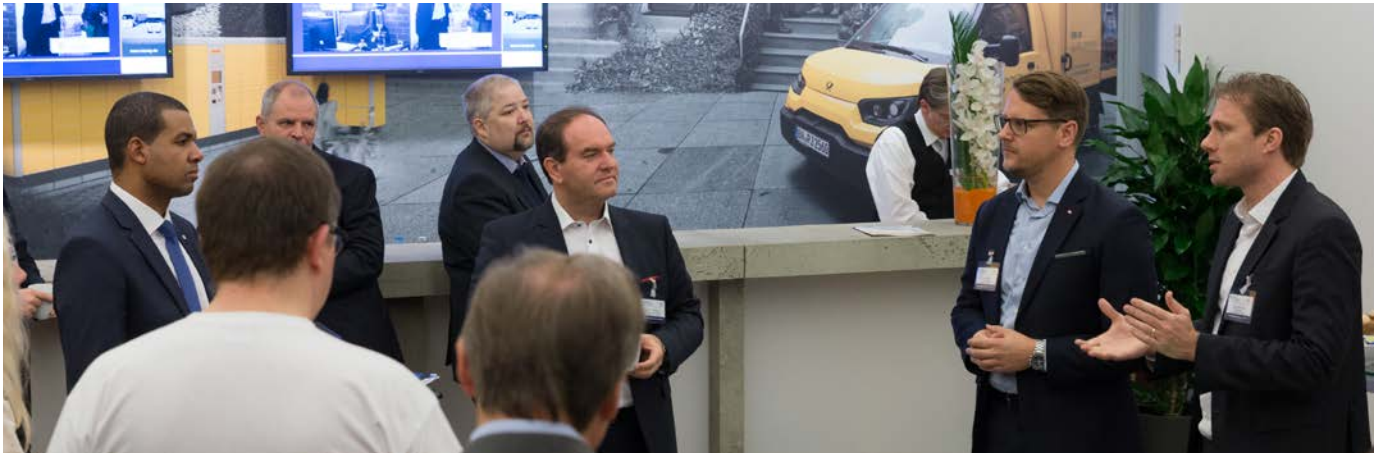
Participants sharing ideas at the International Business Breakfast of the Americas