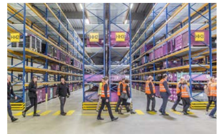
Participants at the DB Schenker Supply Chain Day in Leipzig

Supply Chain Day on 21st April attracted around 40,000 visitors to 458 events worldwide. "When we talk about logistics, we are talking about complex processes that are of immense importance for the economy and