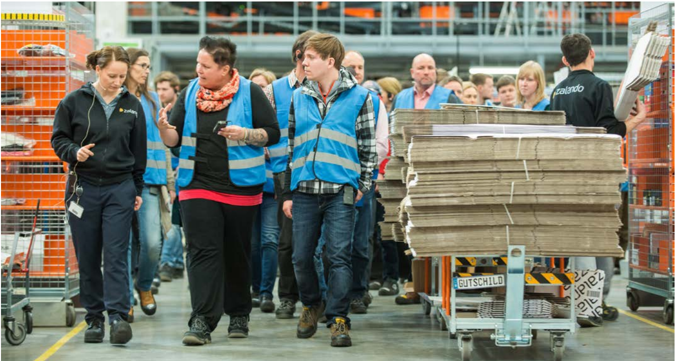
Supply Chain Day allows the public to take an exciting look behind the scenes

➔ Day of action In 2007, the BVL Chapter Chairs came up with an idea that has meanwhile developed into a major success story. They wanted to organise as many company tours as possible on a single day in order to raise awareness levels for logistics among the public at large and show the non-experts what is really behind the term “logistics”. And so it was that BVL launched Supply Chain Day. When this day of action had its premiere in 2008, around 20,000 people took advantage of the opportunity to find out more about logistics solutions and services at 212 events in Germany and Austria.