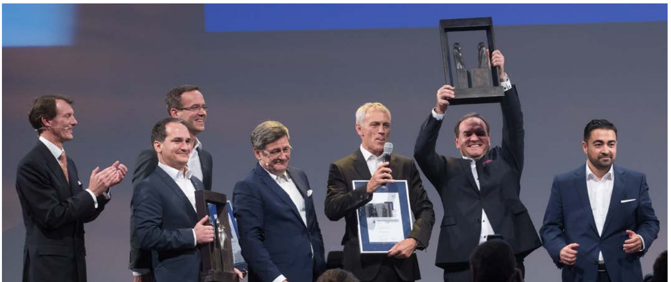
HRH Prince Joachim of Denmark (left) congratulates representatives from AGCO and 4flow on winning the German Logistics Award.