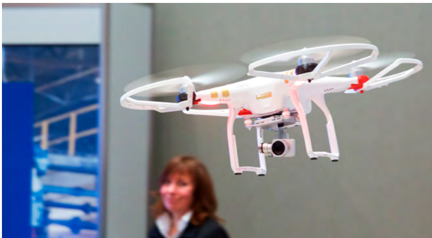
A drone observes driving change in logistics and supply chain

33RD INTERNATIONAL SUPPLY CHAIN CONFERENCE October 19-21, 2016