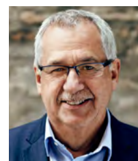
Speakers at the conference (From the top left to right): HRH Prince Joachim of Denmark, Transport minister Hans Christian Schmidt (Denmark,) und H.E. Kamal bin Ahmed Mohammed (Bahrain,), EU Commissioner Günther H. Oettinger, Transport minister Alexander Dobrindt