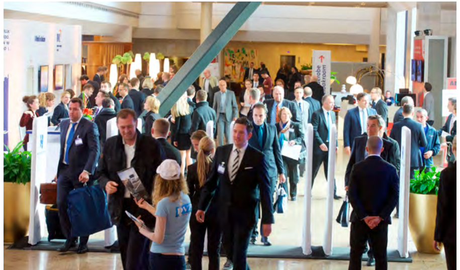
Welcome to the 33rd International Supply Chain Conference: gates open visitors who can expect three informative event days..

➔ Urban Logistics There has been talk of “Smart Cities” in various media for some time now, prompting all manner of political and economic activity. There is still no standard worldwide definition of what makes a city a “Smart City”, but what we can see is the same endeavour around the globe to increase the quality of life in the long term in rapidly growing cities. The German Institute