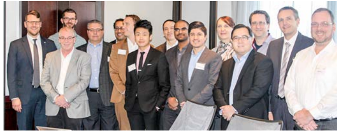
A variety of functions and organisations came together at the first international BVL meeting in Canada

A cross-functional and cross-organisational group of 20 senior managers enjoyed discussing omni-channel solutions with an outstanding selection of international supply chain professionals from companies like DHL Supply Chain, Kuehne+Nagel, Loblaw, SCI Logistics, Shoppers Drug Mart and SSI Schaefer.