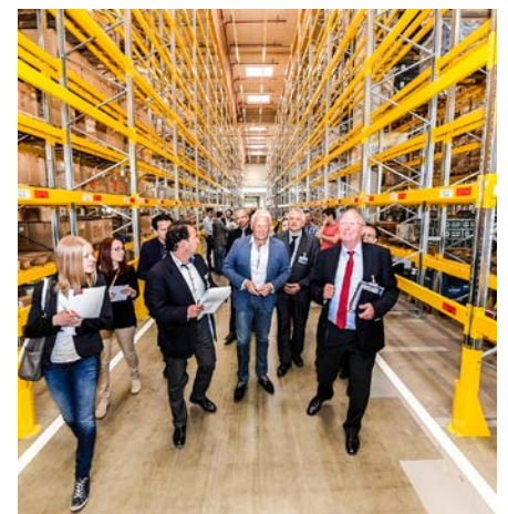
In 2015, Rewe in Neudorf near Vienna showcased food logistics for supermarkets, in particular for the "click-and-collect" concept