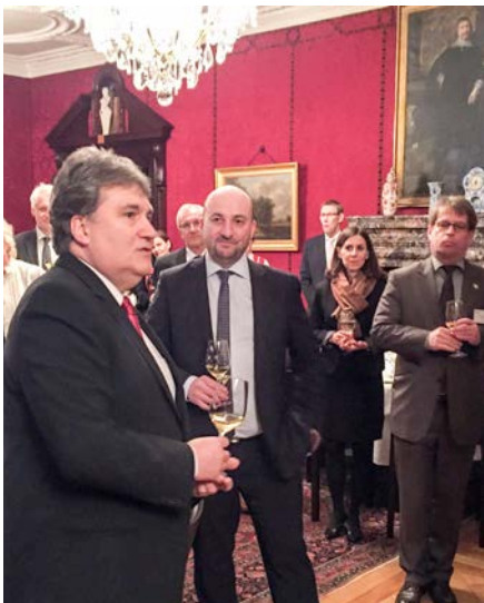
Reception for the Luxembourg delegation in Bremen's town hall

⇒ Visit from Luxembourg On February 4, 2016 Deputy Prime Minister and Economic Affairs Minister Etienne Schneider paid a two-day visit to Bremen together with a delegation of almost 40 business leaders – following an invitation from former Bremen Mayor Jens Böhrnsen during his visit to Luxembourg in February 2015.