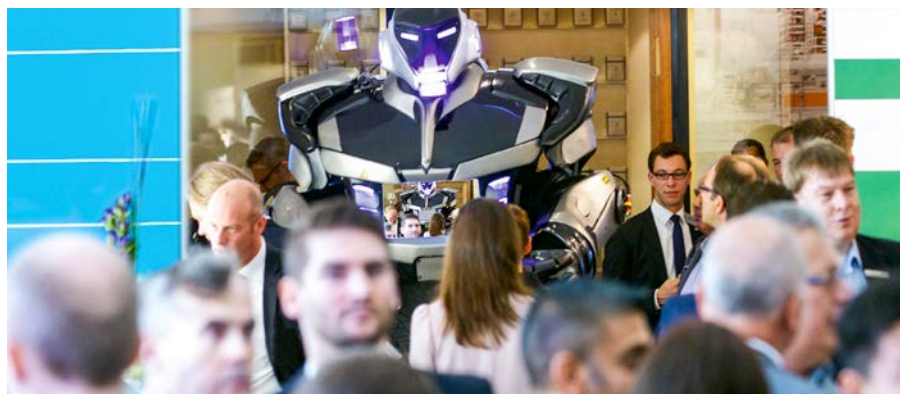
“NOX the Robot” is a symbol for the digital transformation