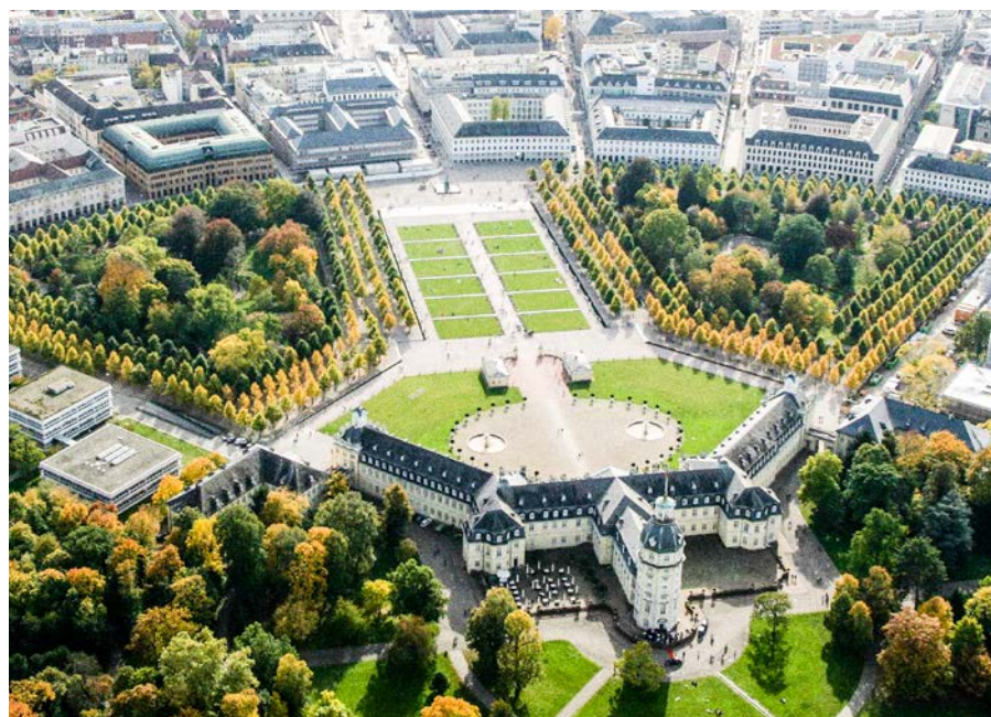
The 8th International Scientific Symposium is held in the fan-shaped city of Karlsruhe