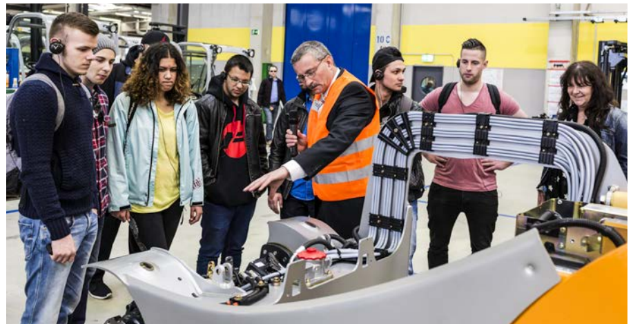
Looking behind the scenes – The Supply Chain Day makes it possible

The day of action will be taking place for the ninth time. In 2015, over 600 companies, organisations, educational establishments and research institutions in Germany and 19 other countries took advantage of Supply Chain Day to show 38,500 visitors to 449 events just how “sexy” logistics really is. Supply Chain Day is an opportunity to challenge