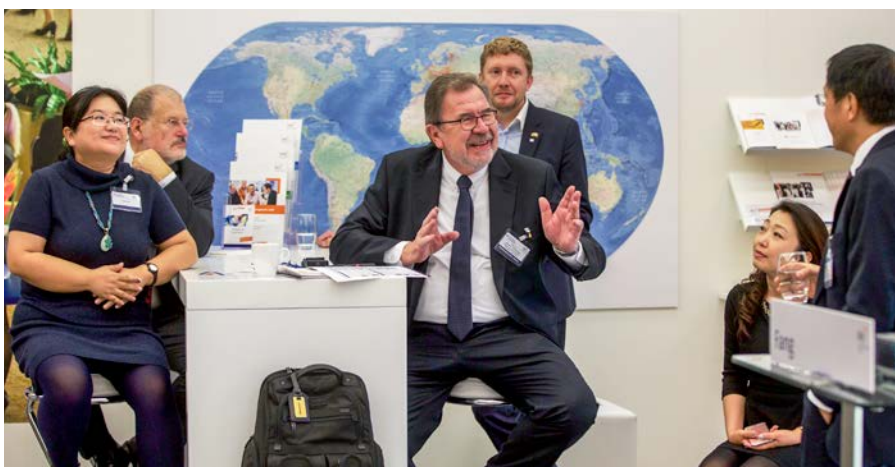
Lively discussion at the international breakfast

⇒ International breakfasts The international programme at the 32nd International Supply Chain Conference was rounded off by international “business breakfasts”. On the mornings of day two and three of the conference, Chapter Chairs and BVL Representatives from abroad held short presentations in the BVL Lounge on current economic developments in Asia and America. The emphasis was on market trends as well as political and economic changes in China, Mongolia, India, Mexico and the USA.