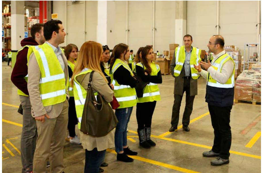
Supply Chain Day 2015 at Ebebek in Istanbul