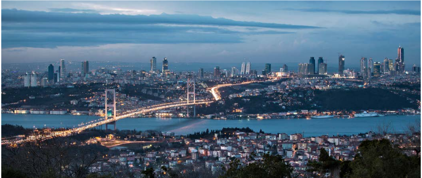
Istanbul – hub for international trade flows

As it becomes increasingly competitive in industrial terms, Turkey is becoming established as a global business location known not only for its traditional exports but also for the production of high-quality consumer goods and high-tech industrial goods. In the mid-19th century, Turkey was still known as the “sick man on the Bosphorus”, but today nothing could be further from the truth, with annual growth averaging five percent. Turkey is investing billions to expand and improve its infrastructure so that it can do justice to its role as an international business centre and logistics hub between Europe, Asia and the Middle East.