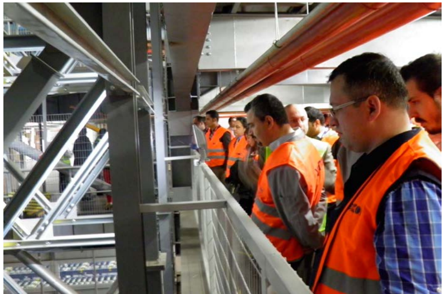
Supply Chain Day 2015 at Ekol in Istanbul