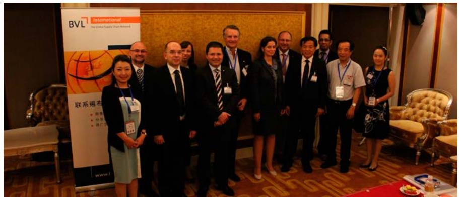
Chairpersons and Representatives Meeting in Shanghai, July 2015