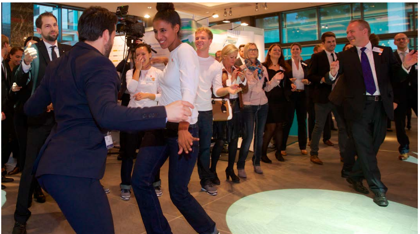
Berlin from Early Bird to After Work