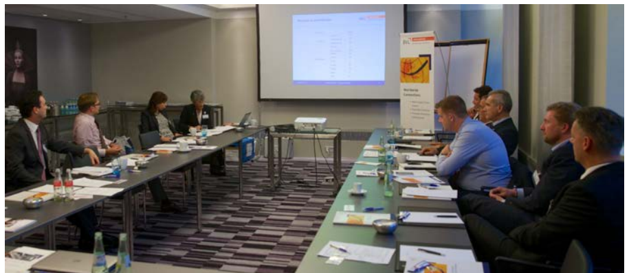
Chairpersons and Representatives Meeting 2014 at the 31st ISCC

The attendees will certainly be happy to get to know each other or see each other again. The some 20 participants will travel from 15 countries, ensuring that the meeting will once again surely provide a platform for a vibrant intercultural exchange.