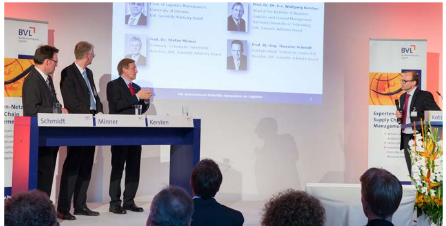
Impression from the 7th International Scientific Symposium on Logistics

BVL International promotes these developments on various levels with the support of a Scientific Advisory Board that advises the Executive Board in all questions relating to science and research. Since it was first held in Magdeburg in 2002, BVL's International Scientific Symposium on Logistics (ISSL) has become established as a central forum for the scientifically oriented logistics community.