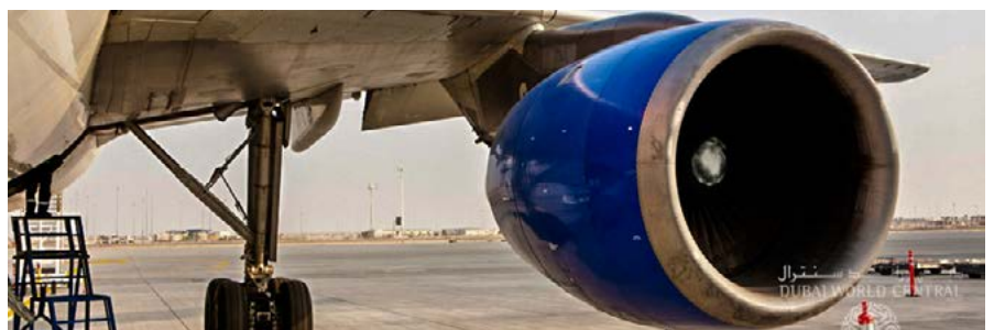
The new Al Maktoum International Airport within the business district of Dubai World central aims to be the new airport hub for the whole world.

With a background in gas, automation as well as logistics, I am responsible for the SICK Sensors Middle East office, based in the Jebel Ali Free Zone, Dubai, and where our most rapidly growing business sector is in logistics automation. The United Arab Emirates is