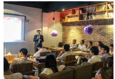
A varied mix of attendees at the Shanghai Logistic Salon