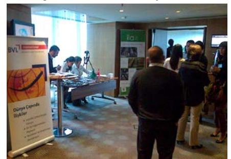
The participants at the chapter event in Istanbul had enough time to visit the BVL stand