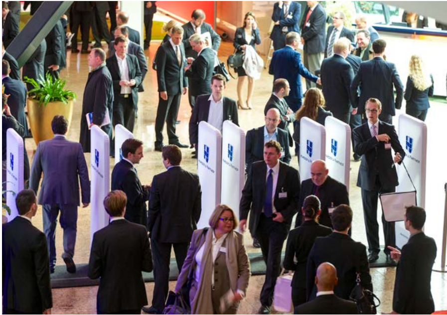
Complexity, Cost, Collaboration is the motto of the 31st ISCC

➔ 31st International Supply Chain Conference Keynotes, special-topic sequences, workshops, excursions, networking ... The three conference days in Berlin from October 22 to 24 will be inspiring and stimulating but also physically and intellectually demanding. With new, “active breaks” and other exercise options, the BVL is offering multiple opportunities for attendees to unwind this year. In the “Active Lounge”, for example, there will be light exercise routines every day that even those in business outfits will be able to enjoy without any problem. Then, on Wednesday and Thursday, there will be ample opportunity for dancing at the Gala Evening and the After-Work Party XL. And on early Thursday and Friday morning, logistics experts can set themselves up for the conference day with a morning run. The connection between outstanding sporting and logistical achievements, and between teamwork and success, will be exemplified at the conference by two leading figures from the world of sport: Verena Bentele and Felix Magath. Bentele, guest speaker at the Gala Evening at the Estrel Convention Center, is one of Germany’s most successful