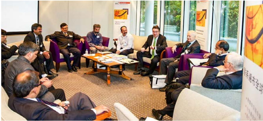
Indian delegation at the 30th International Supply Chain Conference in 2013

➔ International delegations With around 3,200 participants, the 31st International Supply Chain Conference (ISCC) is Europe's largest annual logistics event. The conference also attracts high numbers of international attendees from more than 40 nations. This year, BVL is offering a special delegation package for politicians and industry representatives from abroad who would like to attend the conference for the first time: for delegation sizes of 10 persons or more, there are reduced admission fees, a tour of Berlin and the opportunity to present the country from