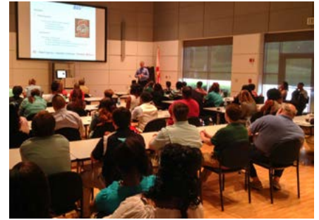
Meeting of the Chapter US Southeast in Tuscaloosa

Each of the ten international BVL chapters organises three to four events a year.