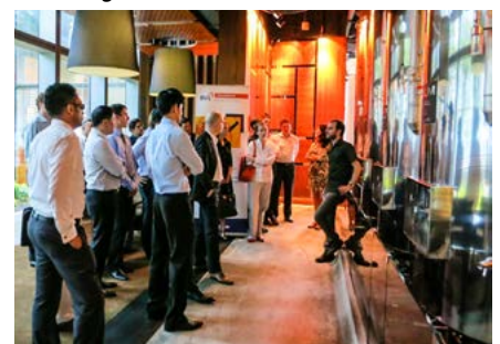
Participants and organisers at a brewery in Singapore