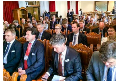
Around 60 participants in Moscow found out more about logistics solutions in Germany