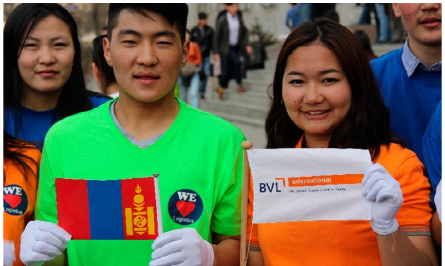
We love logistics – this was the slogan for the activities organised by students in the Mongolian capital