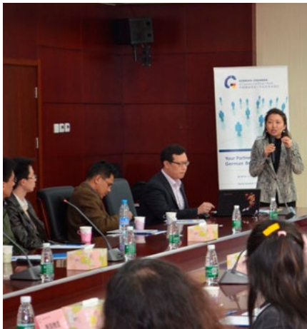
BVL Chapter Beijing visiting the largest Chinese e-commerce wine company at the Wuqing Logistics Park