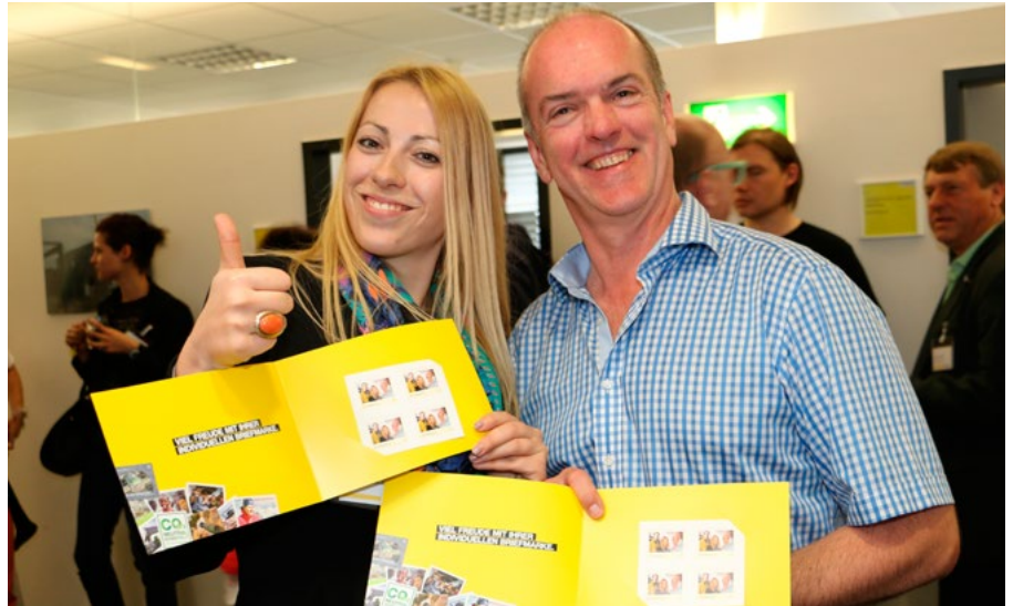
Your own personalised postage stamp – now available at the Austrian Postage Agency in Vienna

The special relationship between BVL and Finnish logistics association LOGY also helped to broaden the geographic scope of the event venues. Two events were organised in Helsinki on April 10 – for logistics experts and students. The event organisers in Hungary were already part for the third time. The countries in which events were organised for the first time included Spain, Portugal, Greece, Switzerland and the Czech Republic.