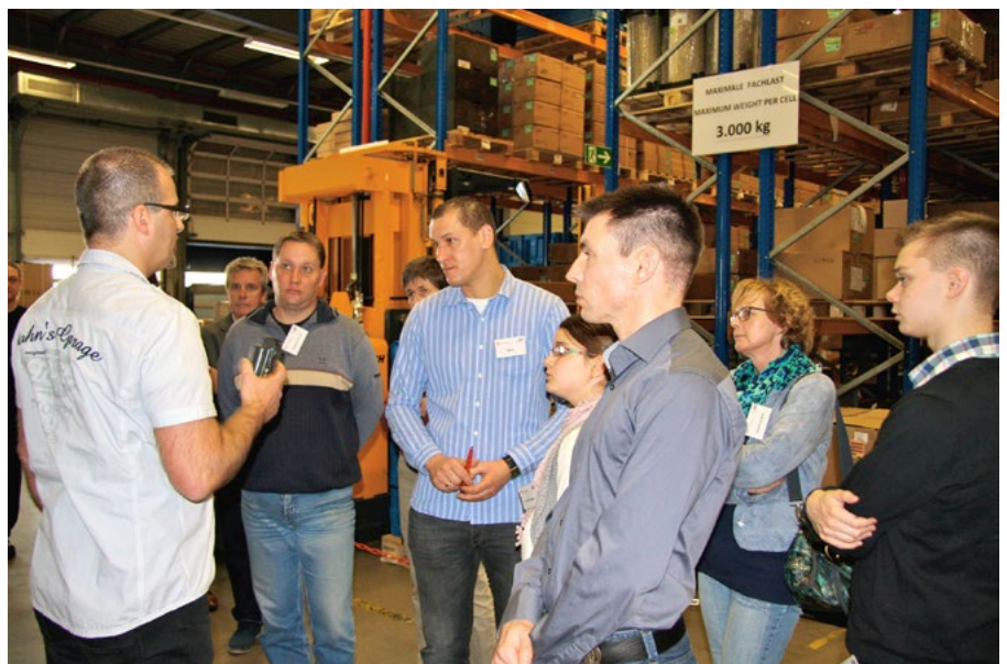
Interested visitors enjoying a tour through the storage facilities of IEE S.A. Company in Echternach, Luxembourg