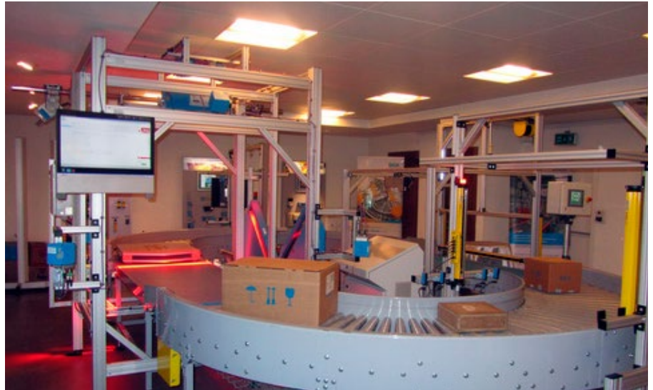
State-of-the-art automation solutions and industrial sensors were exhibited in Istanbul