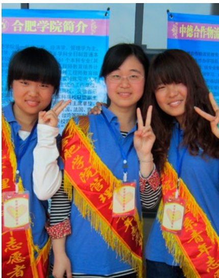
Upbeat mood among students in the LOGinCHINA programme at Hefei University