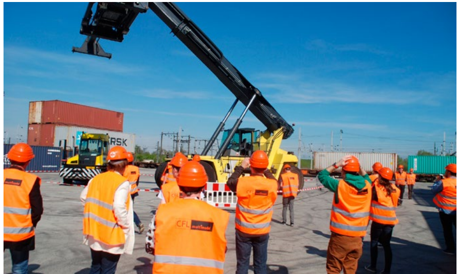
The CFL Multimodal Cargo Terminal in Bettemburg (Grand Duchy of Luxembourg)