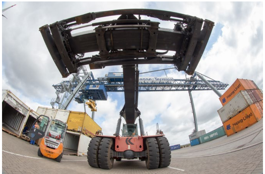
Magdeburg Harbour is located in the middle of Germany and provides an excellent trimodal hub for logistics

Admission fees may not be requested from participants - Supply Chain Day is a not-for-profit event, and all events should be free of charge for anyone who wants to participate.