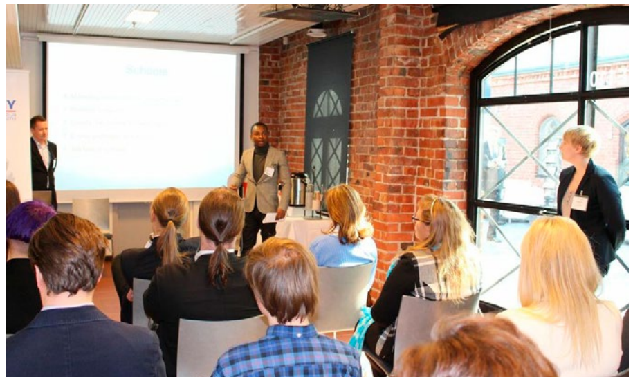
Finnish students from the national LOGY logistics association at an event in Helsinki