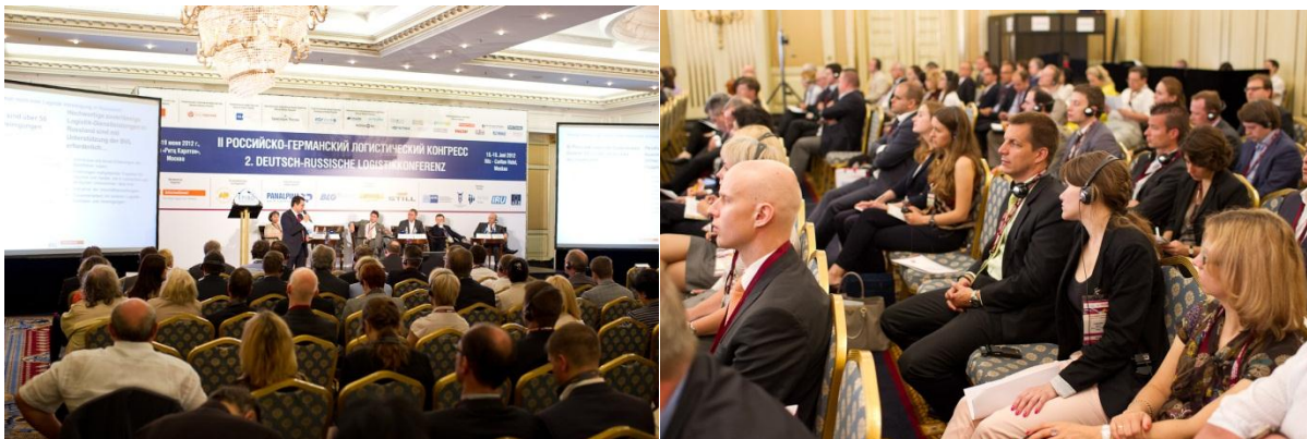
Impressions from the event