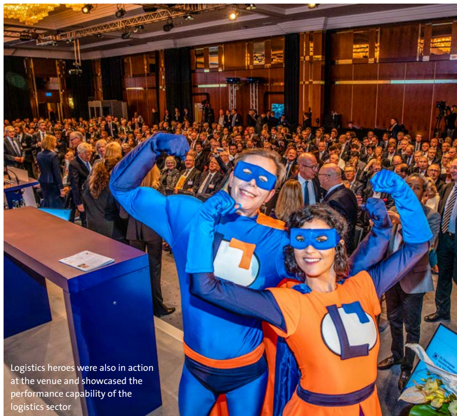
Logistics heroes were also in action at the venue and showcased the performance capability of the logistics sector