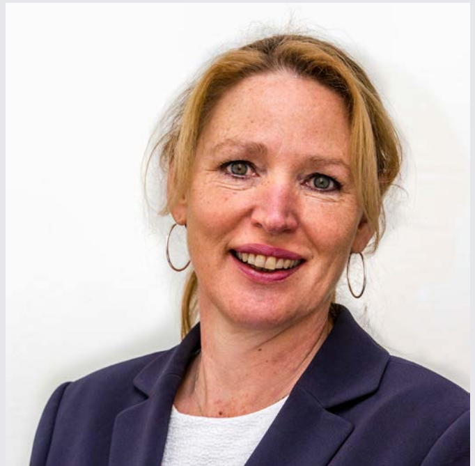
BVL Representative for the Netherlands

tive. Main drivers for this strong position are good physical infrastructure (road, rail, and waterway), favourable labour regulations (flexibility, night work), relatively close proximity to the market and favourable conditions concerning tax and import duties (VAT deferment, postponed accounting). The Netherlands are very competitive on total supply chain cost. The Dutch locations offer very competitive inbound and outbound costs, the same is true for Duisburg and the Belgian locations.