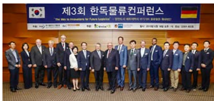
3rd Korean-Logistics Conference key-note speakers and special guests

The BVL Chapter Korea – Seoul's Korean-German Logistics Conference took place for the third year running on 18th June, 2018, and was once again co-organised by Media K& and The Korean Maritime Institute. Held under the title "The Way to Innovations for Future Logistics", the conference featured an array of both Korean and German expert