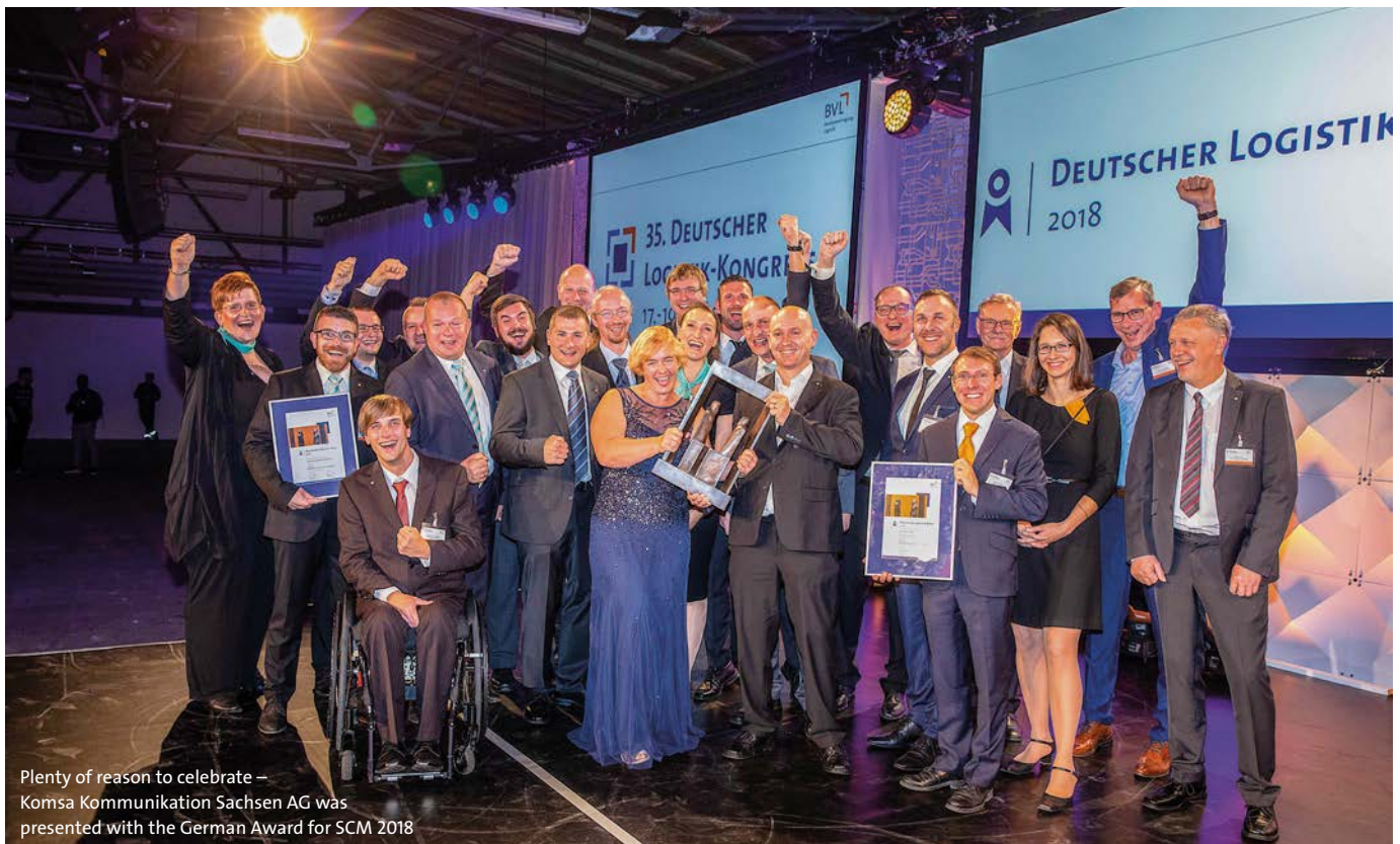
Plenty of reason to celebrate – Komsa Kommunikation Sachsen AG was presented with the German Award for SCM 2018