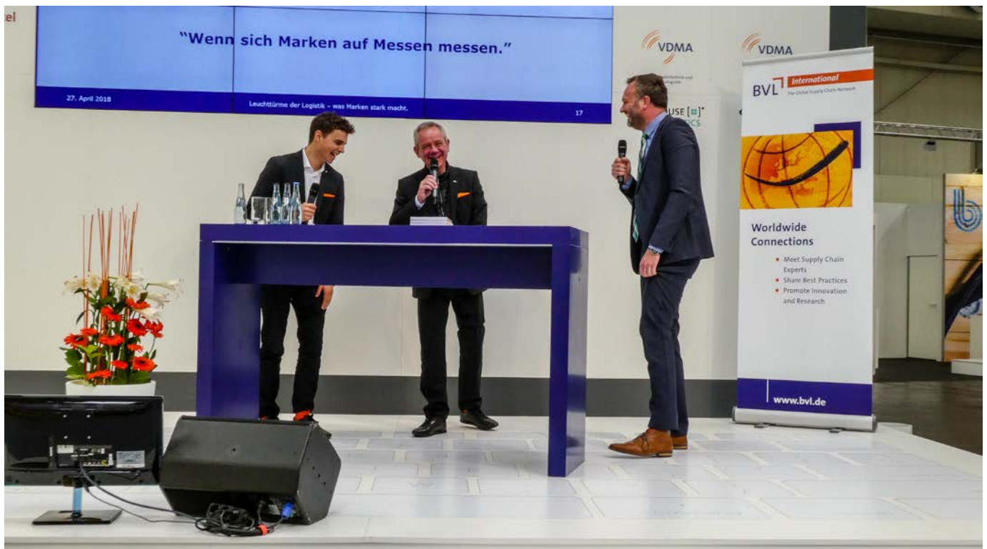
The Image of Logistics topic was a very interactive event