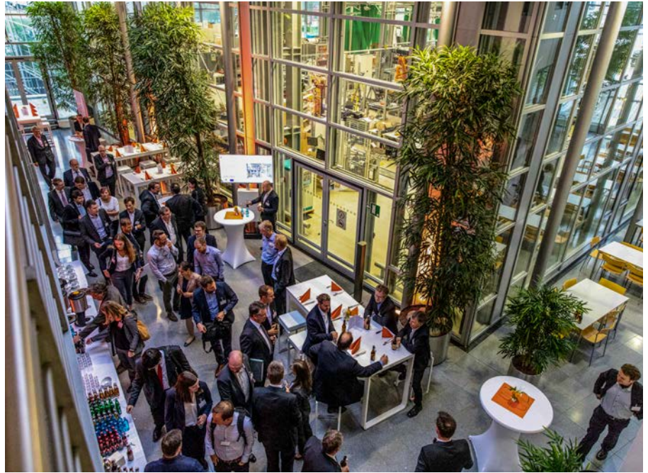
Participants were invited to consolidate their newly-acquired knowledge about robots and platforms in the foyer