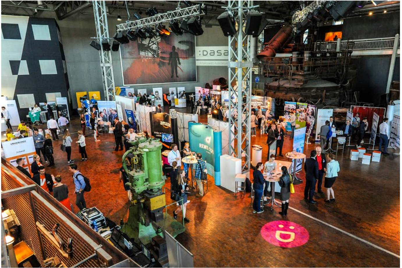
Recruiting fairs – shown here is the LogistikRuhr students' day – were once again attended by several hundred people

➡ Day of Action Blue skies and bright sunshine – many places had perfect weather for the 11th Logistics Day on 19th April. More than 35,000 people took the opportunity to get a glimpse behind the scenes where more than 340 events made for a varied and interesting experience. Besides factory visits, there were many new and exciting innovative events. Visitors in Dortmund, for example, enjoyed a trip in a historic railcar to follow a container's journey along the rails. Starting at the container terminal, they discovered how railways can be integrated into complex logistics processes, right up to the point of transshipment at the container's destination. Airports and seaport terminals opened their doors, and inland waterway terminals throughout Germany could be admired from both their land and water aspects. For the first time, a logistics BarCamp was held in Duisburg. This year's programme also included readings and a World Café.